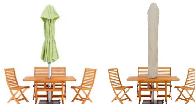
Closed and strapped

Application: Patios, restaurants, hotels, poolside loungers... areas that require a moderate wind tolerance with an effortless opening and closing function.