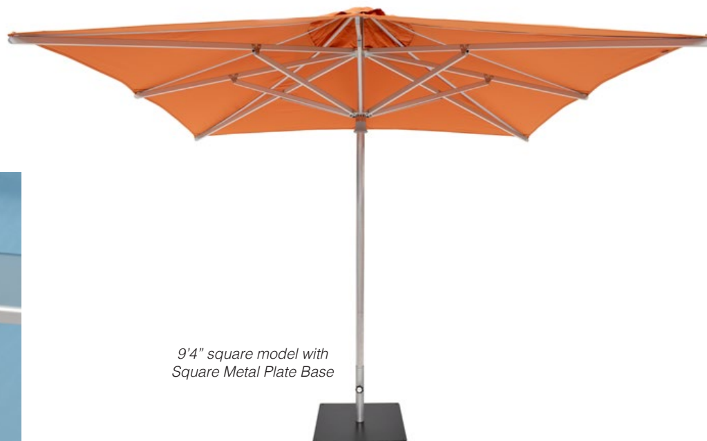
9'4" square model with Square Metal Plate Base