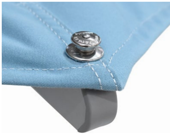
Polymer end caps with stainless steel LOXX canopy fasteners