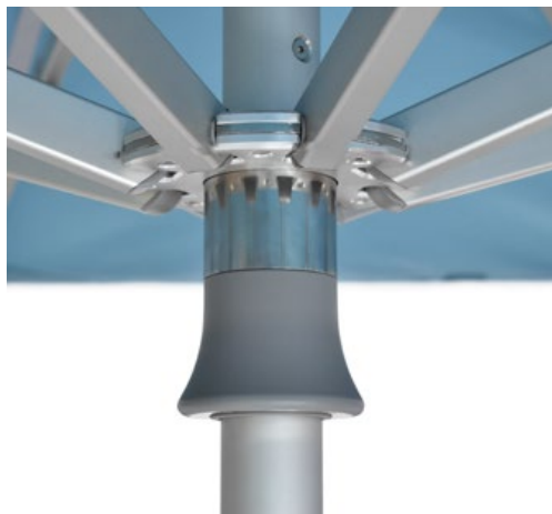
The sliding lower hub is made of a combination of stainless steel, aluminum and polymer