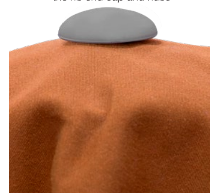
Polymer finial color matches the rib end cap and hubs