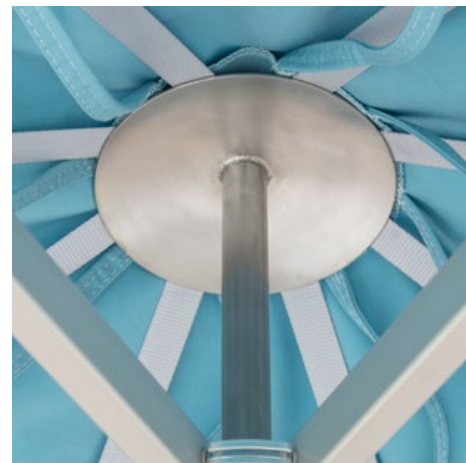
Top dome made from solid stainless steel for strength and longevity