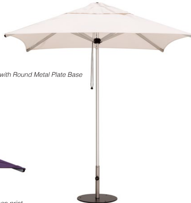
Square model with Round Metal Plate Base