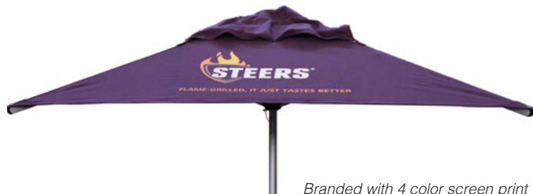
Branded with 4 color screen print