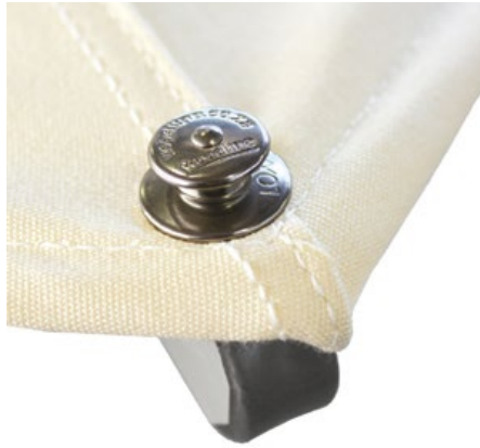
Smart canopy attachment system for easy removal for cleaning or changes