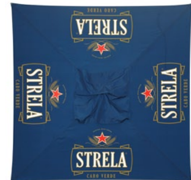
Branded with 4 color screen print