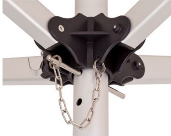
Anodized aluminum pole with glass-filled composite upper and lower hubs