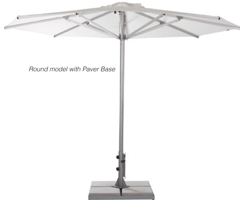
Round model with Paver Base