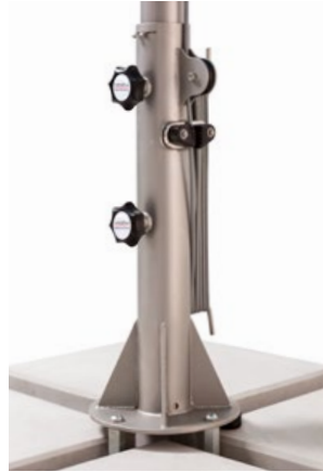
Rope Lock Stand fixed to a Paver Base