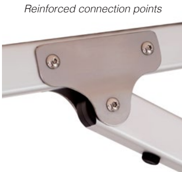
Reinforced connection points