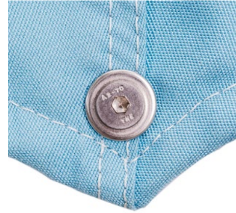
Secure stainless steel eyelet attachment system for easy removal