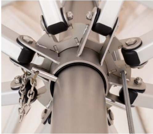
The heart of the Storm is the smooth-sliding stainless steel hub